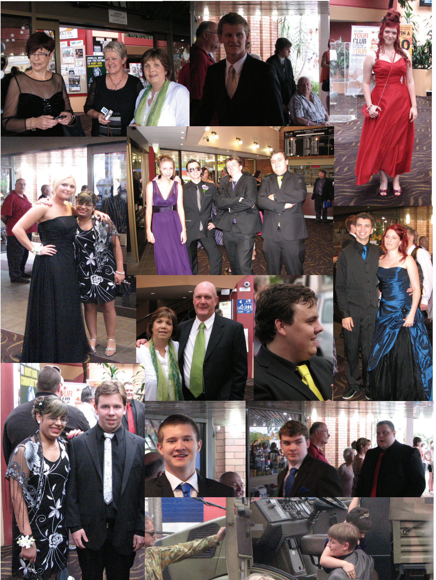
Photo from the Year 12 Formal held at Lismore Workers Club on Tuesday 15th November 2011