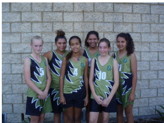
Above: Our 7/ 8 Girls team who were narrowly defeated in the grand final