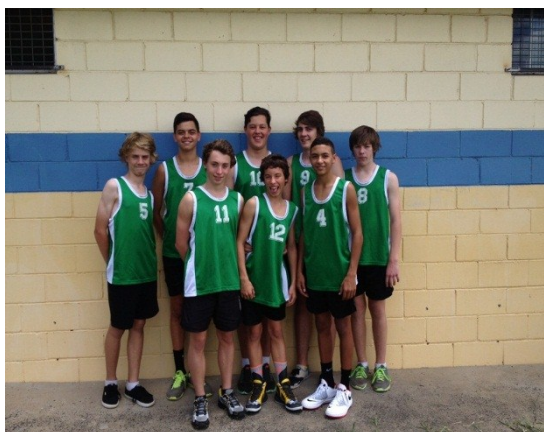
Above: Boys Team