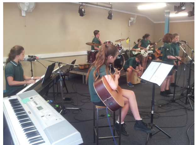
Now we have plenty of room to rehearse!