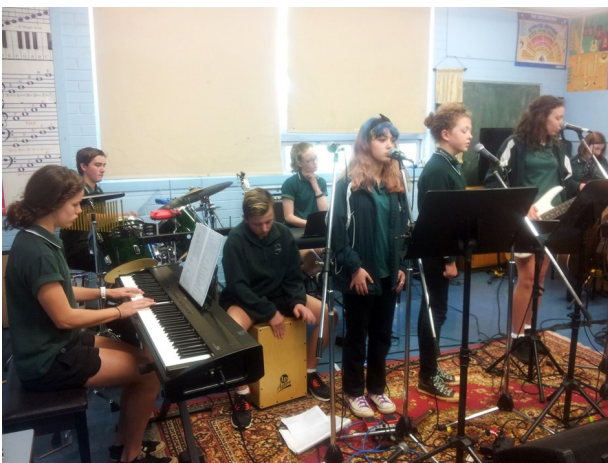
CAPA staffroom - Where our temporary music classes were held