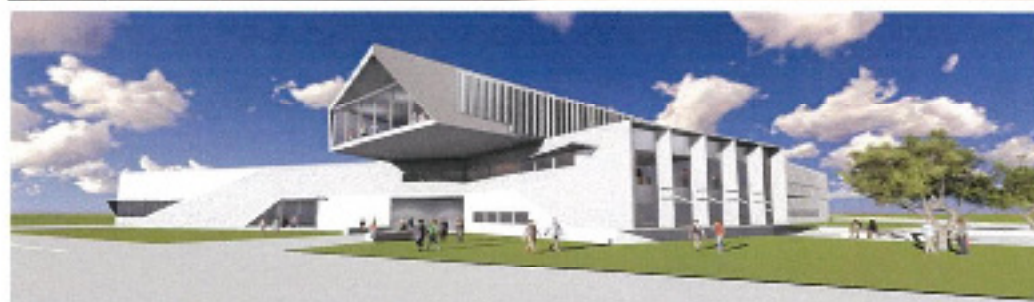
Figure 1 - A 3D perspective of the proposed concept design