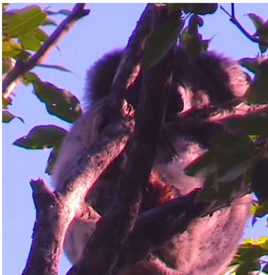
Koala spotted high in the trees at Kadina High last term

If your child did not receive their Semester One reports at the end of last term, you should contact the school office to arrange for it to be made available, or alternatively ask your child to speak to their Year Adviser.