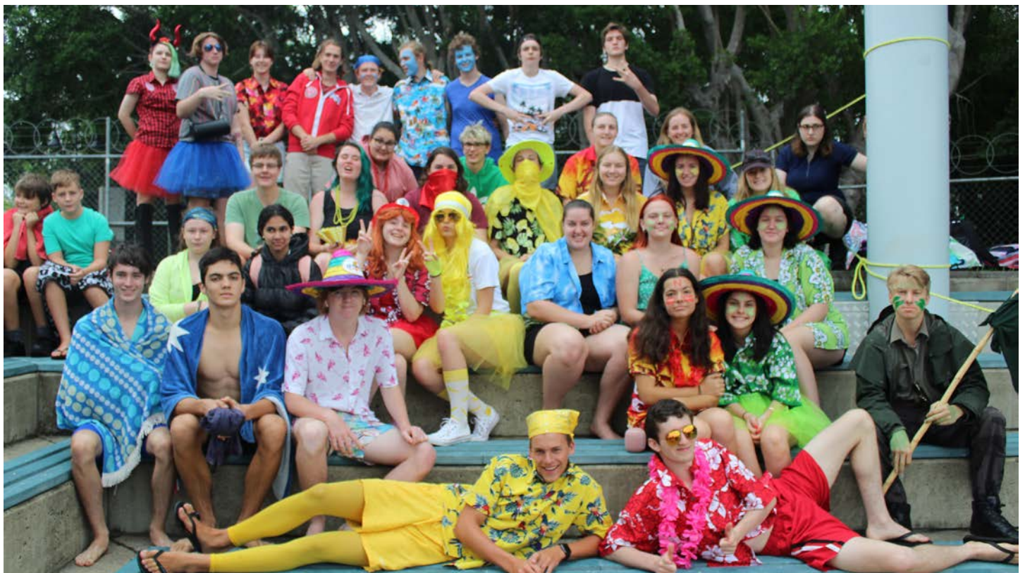
2020 Kadina Swimming Carnival.