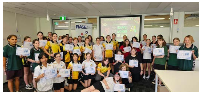
Congratulations to these young women for developing amazing solutions!

This involved researching the topic, brainstorming ideas, and creating a plan . The problems ranged from water wastage, reducing barriers for farmers to adopt sustainable practices, combatting oil waste in sewage systems, improving access to candidates for employers in the Northern Rivers and promoting the use of reusable menstrual products.