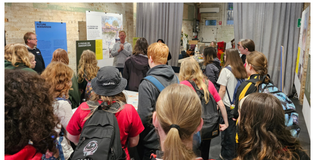
Students visited the Living Lab office and walked the CBD to get understanding and inspiration.

In the aftermath of the 2022 floods, Living Lab Northern Rivers is undertaking a co-design process that brings together local knowledge and technical expertise to plan a sustainable future for Lismore. Part of this process is a significant community consultation process, seeking feedback from a diverse cross-section of the community. Gaining youth engagement was proving challenging, so RASE developed and delivered a workshop to address this issue.