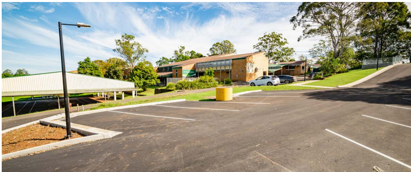
Kadina High Campus car park works completed May 2025.